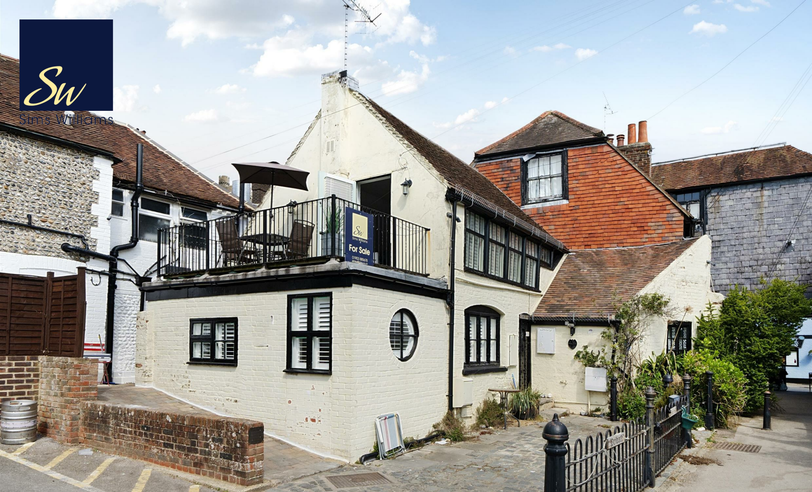
UNICORN COTTAGE 39A HIGH STREET, ARUNDEL, WEST SUSSEX, BN18 9AG